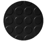
Circular studs (MC 2K1)