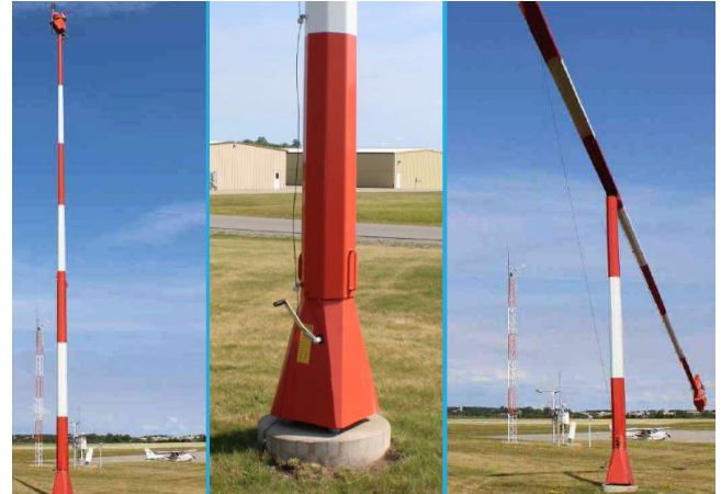
Optional Beacon Tipdown Pole

Wind: Tested to velocities up to 100 mph (161 kph)