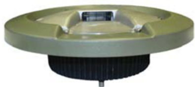
In-pavement Fixture with Snow Plow Ring

In-pavement flasher height is 0.75 inch without the snow plow ring and fits on a standard FAA 12-inch base can. Fixture height is 0.5 inch with the snow plow ring. The ring adapts from 12 inches to 16 inches and is mounted on an FAA L-868C base can.