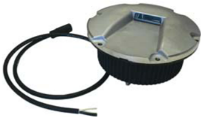
In-pavement Fixture with Mating Female Connector

Each in-pavement fixture houses a low-voltage (400 VDC) flash tube and trigger transformer. A safety interlock switch disconnects the individual control cabinet (ICC) power when the bottom cover is removed.