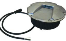
Figure 1. In-pavement Fixture with Mating Female Connector

Each in-pavement fixture houses a low-voltage (400 VDC) flash tube and trigger transformer. A safety interlock switch disconnects the individual control cabinet (ICC) power when the bottom cover is removed.