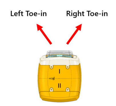
Toe-in determined by standing on top of the light fixture looking in the direction of the beam.