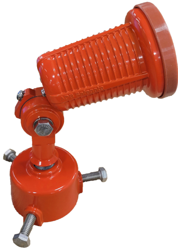
PAR-38 Lamp Holder

There are 45 PAR-38 lamp holders mounted five to a light bar in the runway approach. Each lamp holder is designed to accommodate 150 W, 120 VAC PAR-38 lamps. An adjustable base on the lamp holder permits vertical adjustment from the horizontal to 25° above the horizontal. Also, the mounting hardware permits horizontal alignment of the light beam axis to any horizontal angle within +1°. The lamp holder has a mounting base that mounts on the open top of a frangible coupling, on a light bar with an adapter sleeve, or to a 2-inch (EMT) conduit.