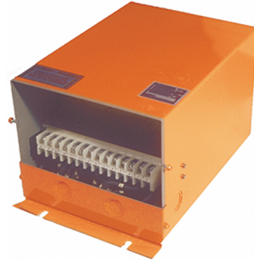
15 kVA Transformer

The 15 kVA, 60 Hz power transformer powers the steady-burning PAR-56 and PAR-38 lights. Taps on the transformer are switched by contactors in the master control cabinet to provide power at any one of three voltage levels to the steady-burning lights. Taps provided on the primary of the transformer permit secondary voltage adjustment to within 2.5% of the required secondary output assuming the primary voltage is between 210 V and 252 VAC. The transformer is housed in an outdoor, rain-tight enclosure with lugs provided on the back of the enclosure for mounting the cabinet in a vertical position. Two external lightning arresters are provided for input and output lightning protection.