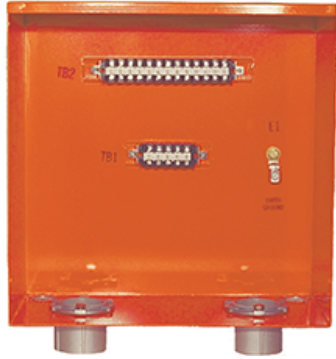
Steel Junction Box (Standard)

Junction boxes are used to distribute power and control signals to the ICCs. One junction box is required for each sequenced flasher in the system. Each junction box has two terminal strips to accommodate the incoming and outgoing power, control circuit, and monitoring wire for the flasher unit.