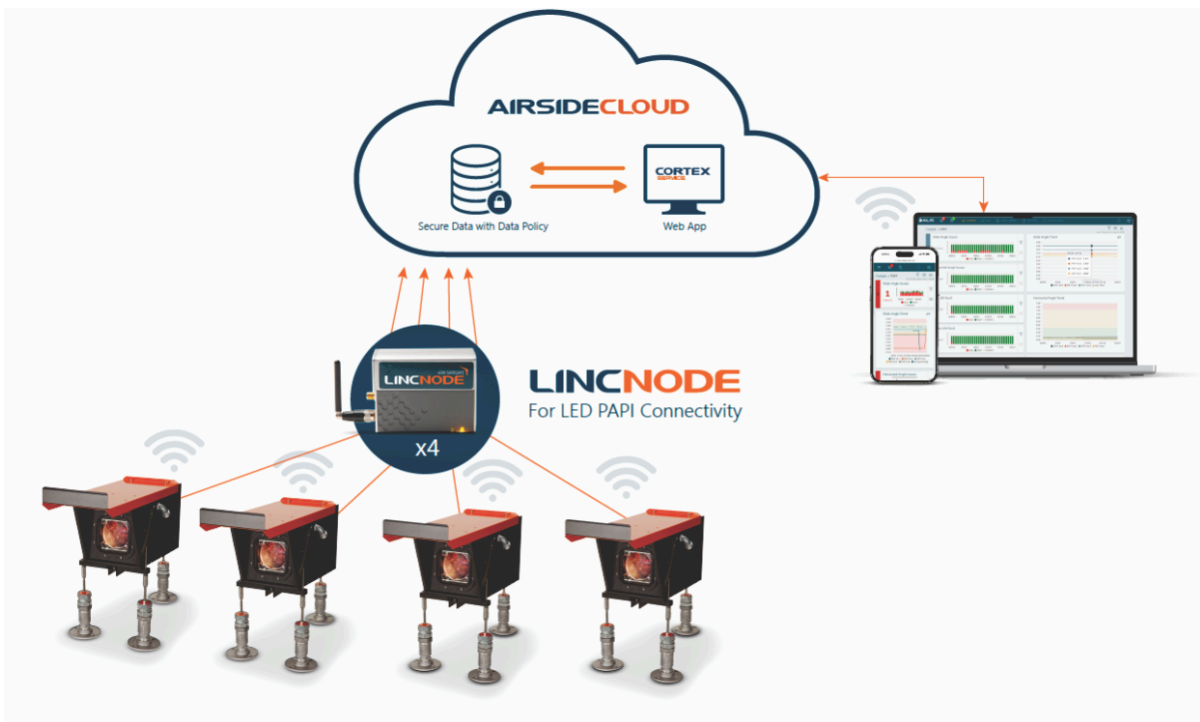
Figure 2. LINC Node PAPI Connect