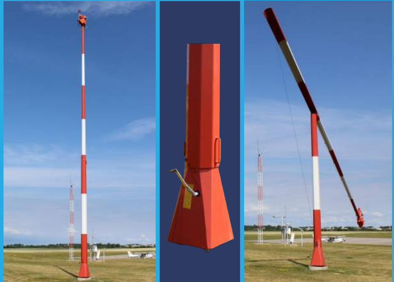
Optional Beacon Tipdown Pole

Compliance with Standards: (ETL CERTIFIED) FAA: L-801A(L) A/C150/5345-12F Medium Intensity Airport Beacon. ICAO: Annex 14, Volume 1