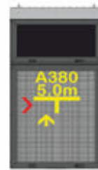
Pilot guidance view