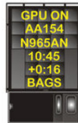
RIDS capability, T2-24 only, 6 rows, 4-6 characters/row