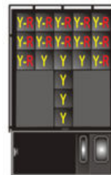
T2-18 LED configuration