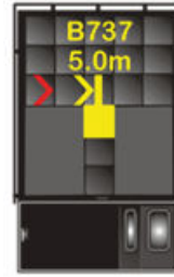
T2-18 pilot view