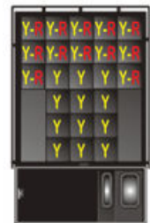
T2-24 LED configuration