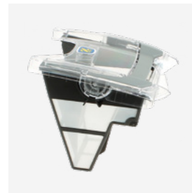
Filter canister (3 L) Easy access