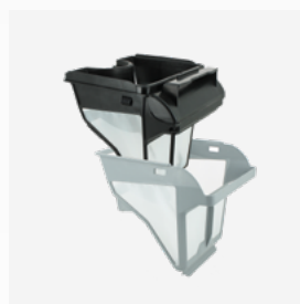
Filter canister Dual stage filter: 150/60 μ