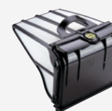
5-litre filter canister Easy access and large capacity