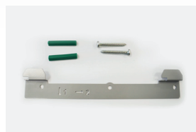
Wall mounting kit