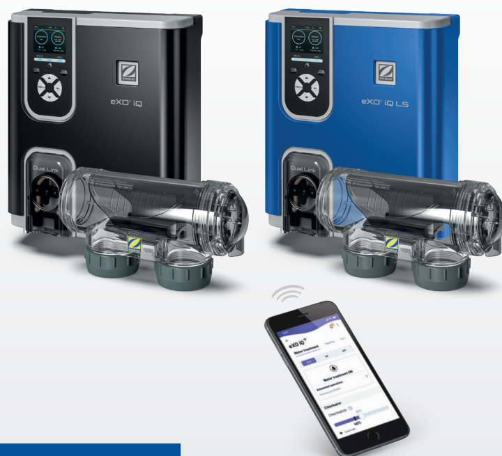
Models shown with optional pH regulation modules