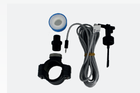
Flow switch kit