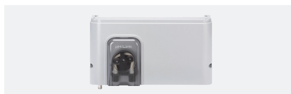
pH Link module (pH regulation)