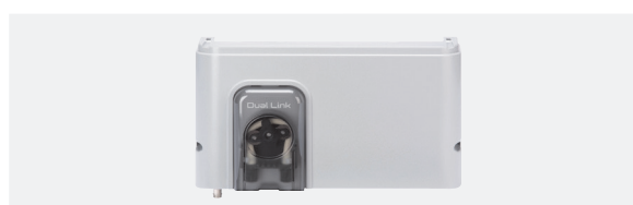
Dual Link module (pH and ORP regulation)