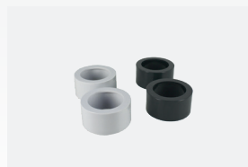
Reducing bushes kit