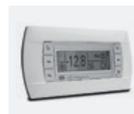
Remote control module