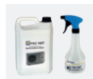
Net heat pump kit