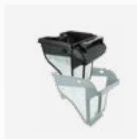
Filter canister Dual stage filter: 150/60 μ