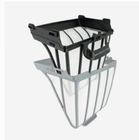
Main filter 150 µ for Dual-Stage or stand alone use Ultra-fine over filter 60 µ for Dual Stage use