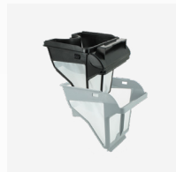
Filter canister Dual stage filter: 150/60µ