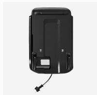
Charging and storage station