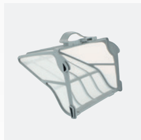
Filter canister Very thin, large-capacity rigid filter (5 litres)