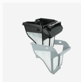
Filter canister Dual stage filter: 150/60 μ