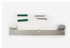
Wall mounting kit