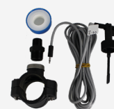
Flow switch kit