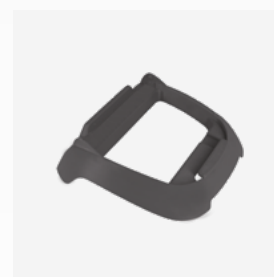
Base for the control unit