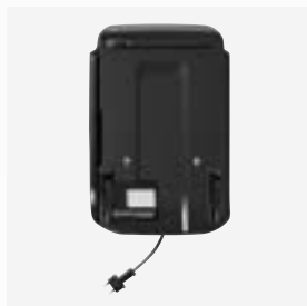
Charging and storage station