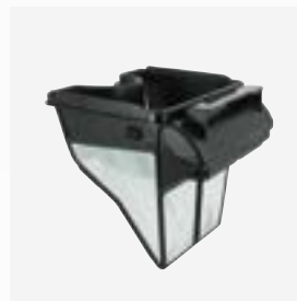
Filter canister filter: 100 µ