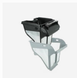
Filter canister Dual stage filter: 150/60 µ