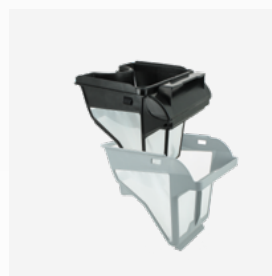
Filter canister Dual stage filter: 150/60 µ