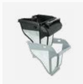
Filter canister Dual stage filter: 150/60 µ