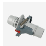
Automatic flow rate adjustment valve (skimmer)