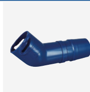
45° extended rotating elbow