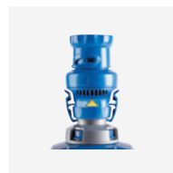
Flow regulator (cleaner)