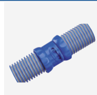
Twist Lock hose