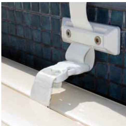
ABS bracket for wall fixing