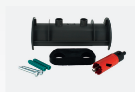
Cell installation kit for 50-mm and 63-mm hoses