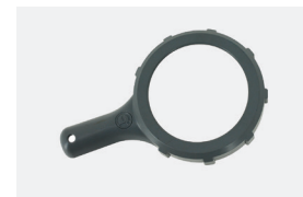
Locking ring wrench