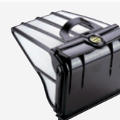
5-litre filter canister Easy access and large capacity