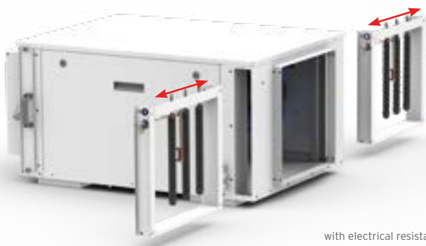
with electrical resistance

Since these systems are directly installed in the dehumidification unit, they do not take up additional space and are easy to set up. They just need to be slid into their slot.