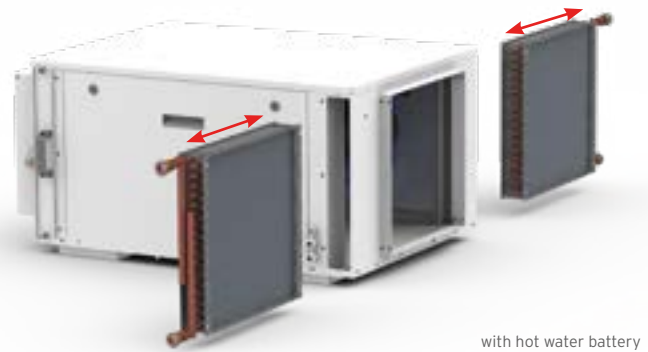
with hot water battery