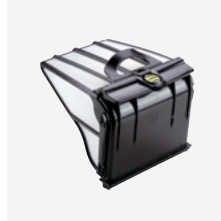
Filter canister Easy access and large capacity (5 litres)