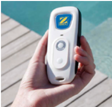
Motion sensing remote Responsive cleaning control in the palm of your hand