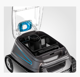
TOP ACCESS FILTER Offers real daily ease of use.