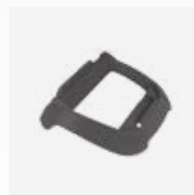
Base for the control unit