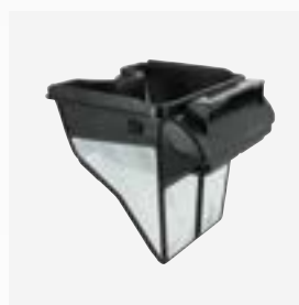
Filter canister Simple filter 100 µ