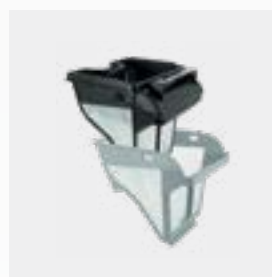
Filter canister Dual stage filter: 150/60 µ