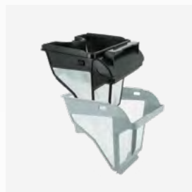
Filter canister Dual stage filter: 150/60 µ