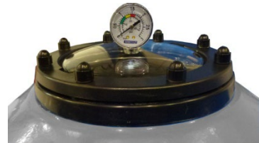
▪ Transparent lid with screws