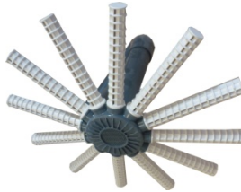
▪ Fitted with 1" collector arms ▪ Laterals with an open line of 3mm