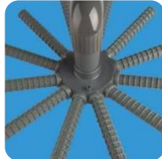
▪ Fitted with 1" polypropylene collector arms reinforced with fiberglass