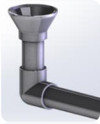
▪ Cone diffuser