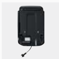
Charging and storage station