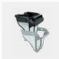
Filter canister Dual stage filter: 150/60µ