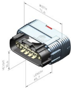
APEX® ErgoMate™ 24W Female