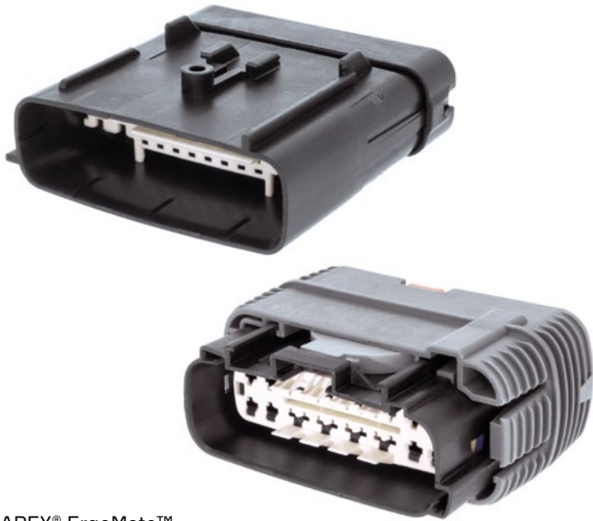
APEX ® ErgoMate ™ 24W Female & Male