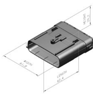
APEX® ErgoMate™ 24W Male