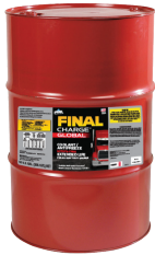
FXA0B1 55 Gallon Concentrate Drum UPC: 074804-02067-0