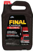
FXA0B3 1 Gallon Concentrate Bottle Gallon UPC: 074804-00836-4 Case UPC: 074804-10836-1 Case SCC 14: 1-0074804-00836-1