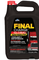
FXAB53 1 Gallon 50/50 Bottle Gallon UPC: 074804-00358-1 Case UPC: 074804-10358-8 Case SCC 14: 1-0074804-00358-8