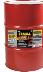
FXAB51 55 Gallon 50/50 Drum UPC: 074804-02068-7