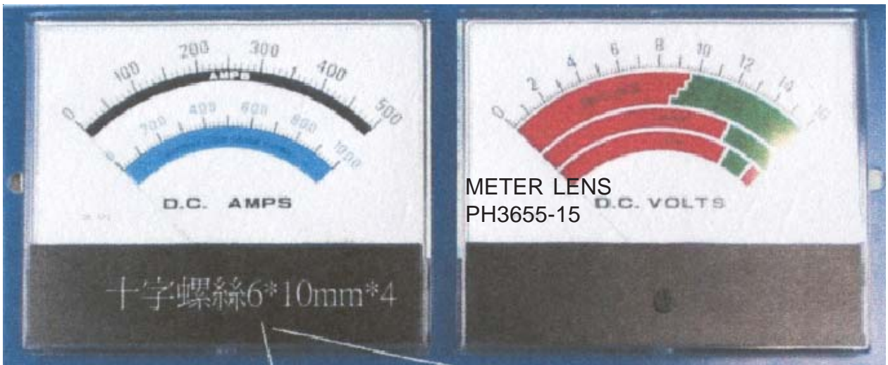
METER LENS PH3655-15