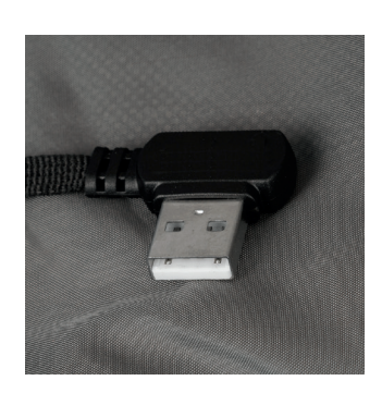
*Based on 18W Quick-charge 25,000 mAh power bank.

The heat sensor is strategically located to give an accurate measurement of the temperature, to prevent over or under heating.