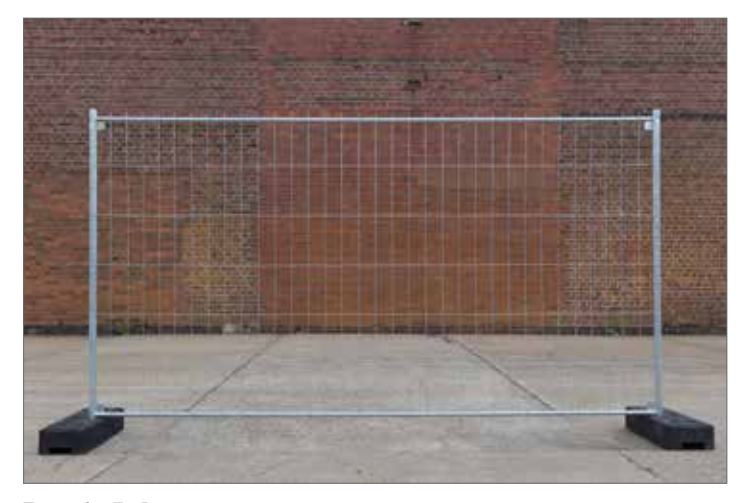
Tempofor F2 Protect