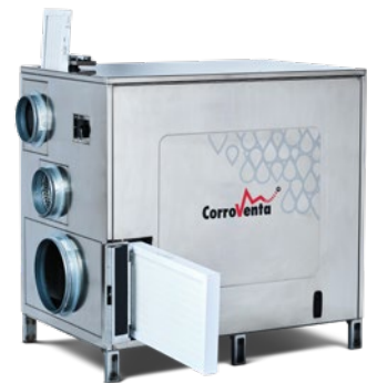
The dehumidifier's filters can be replaced quickly and easily through separate hatches. There is no need to disconnect ducts or remove service hatches.