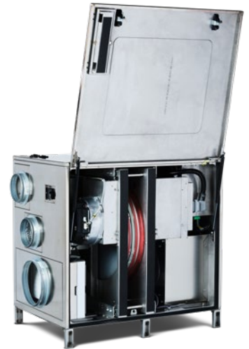
The hatch is kept closed by two compression locks and can be opened without any tools. This provides quick and easy access to the rotor and components.

The A15 has a broad working range and is ideal for dehumidification in the event of major water damage or for building dehumidification. It is also suitable for fixed dehumidification installations in order to control the humidity in warehouses, storage rooms or large water plants, for example.