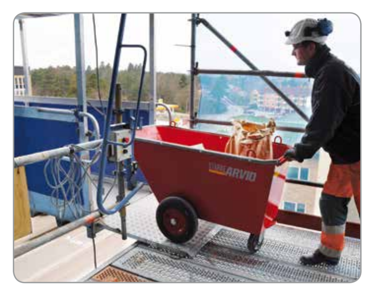
Our Waste Trolley can make its way just about anywhere.

The Waste Trolley is an easily manoeuvred vessel for collecting waste where it is created, thus avoiding double work. The trolley is part of a concept for the effective recycling of plasterboard and other waste.