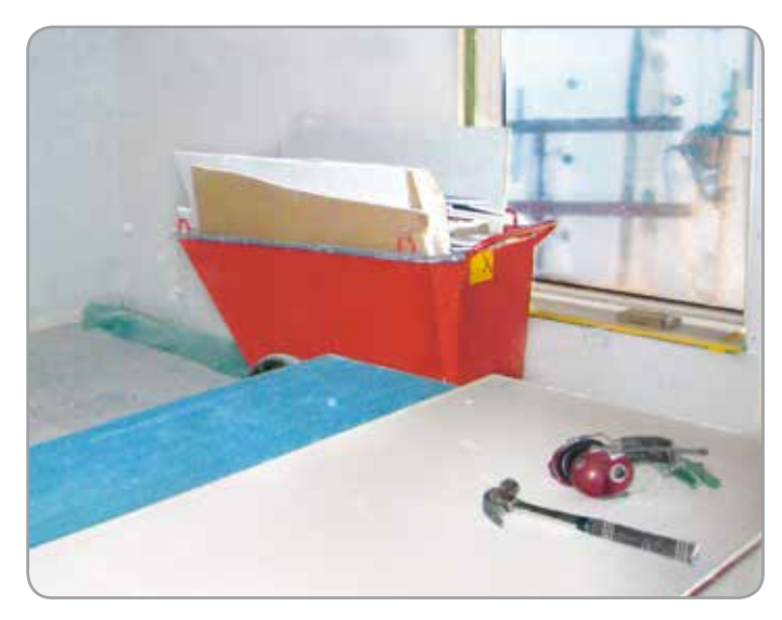
Put your waste where it belongs and avoid extra work.