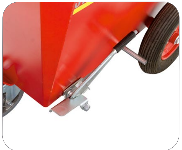
Hand and foot brake Polyurethane-filled wheels