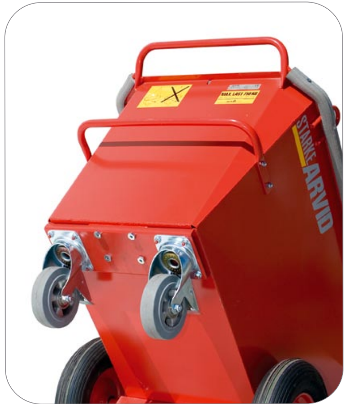
Double castors Double handles