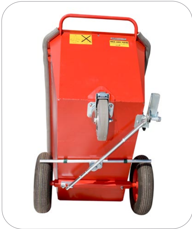
Hand and foot brake