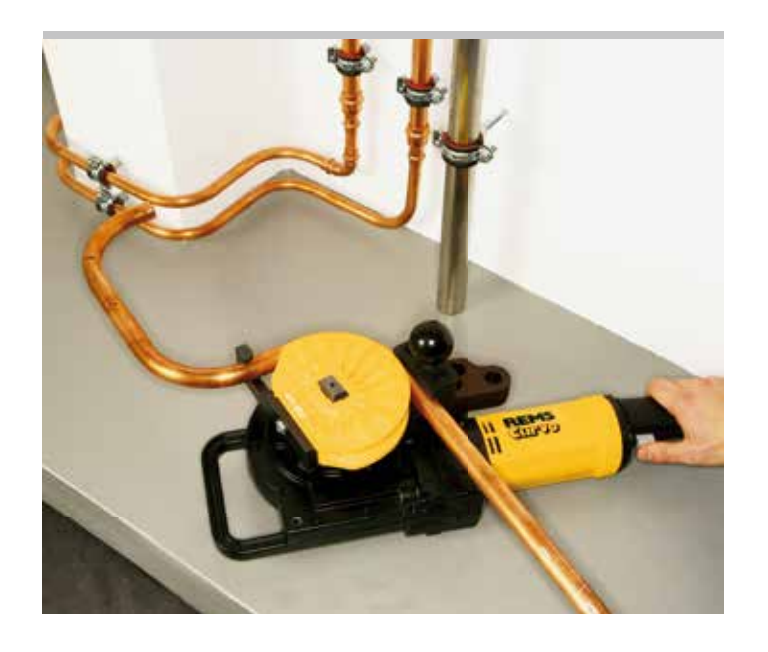
Tested by electrosuisse