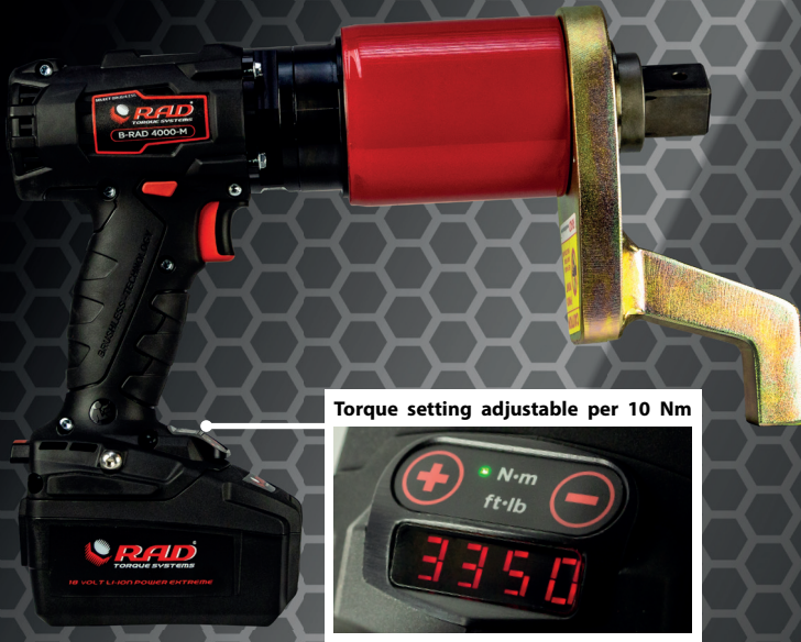
Torque setting adjustable per 10 Nm