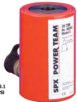
ASME B30.1 10,000 PSI